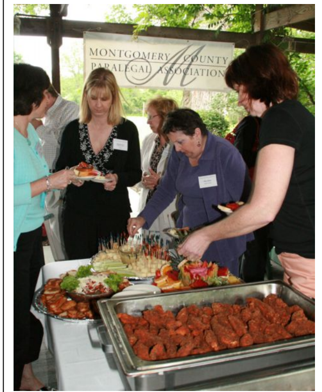
Gettin' the party started!