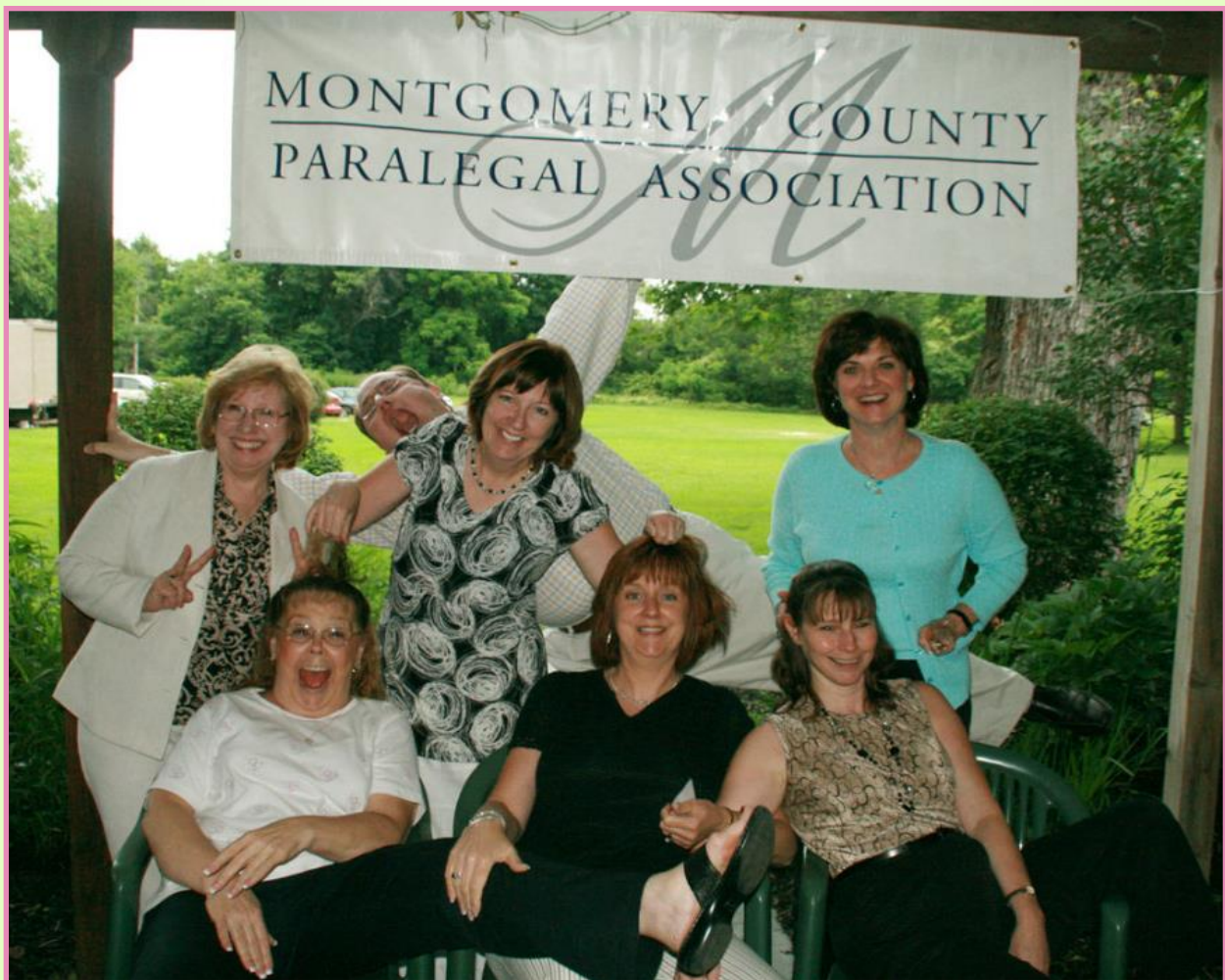
2009 Board at our Summer Social in June