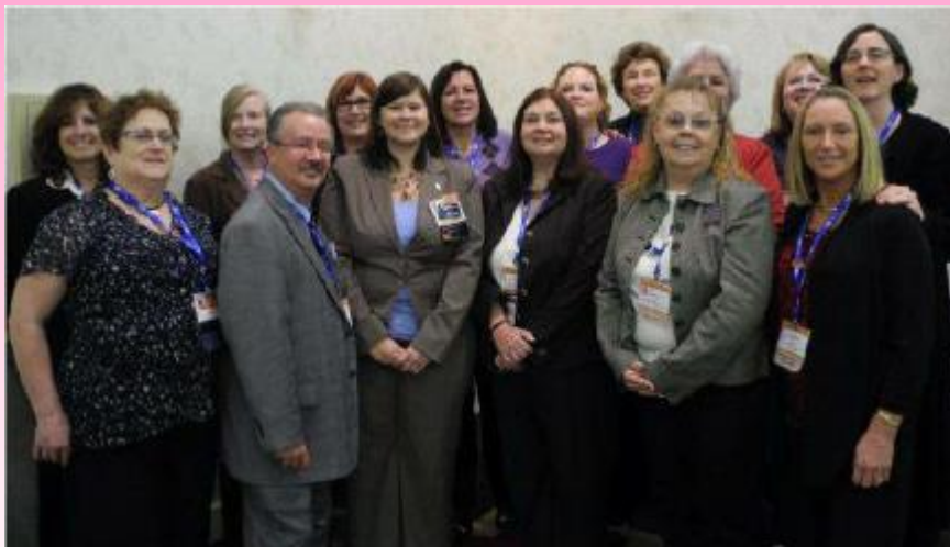
Region IV-2011 NFPA Convention, Minneapolis, MN