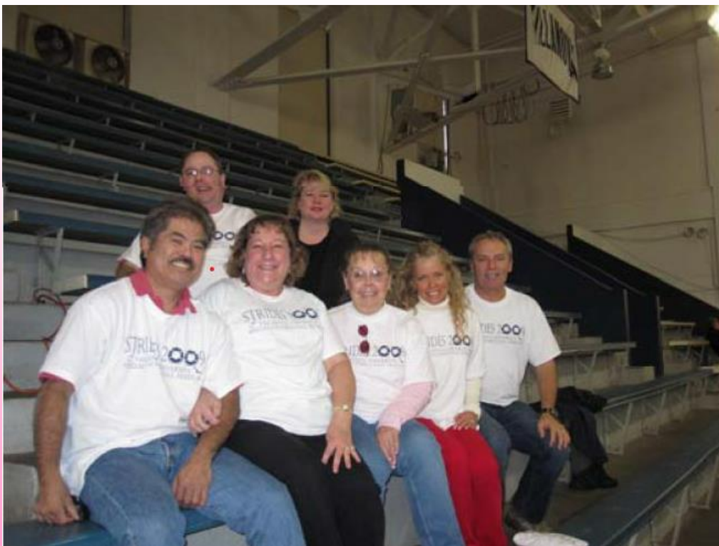
Community Outreach Committee at the 2009 Special Olympics at Villanova University.